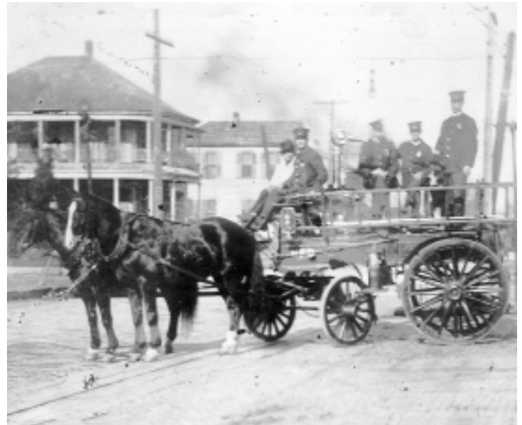
This photo of Hose Wagon #10 was taken in the early 1900's - which was similar to Hose Wagon #5.