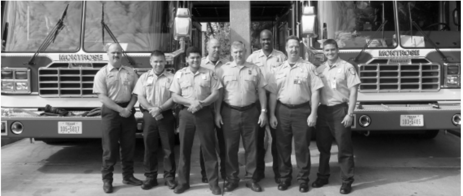
Fire Station 16 C-Shift - 1700 Richmond - November 29, 2008.