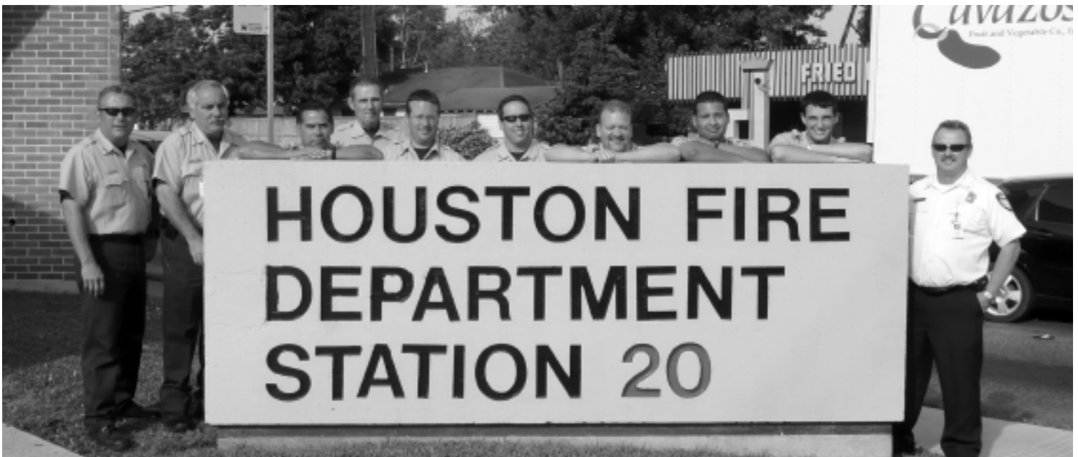
Fire Station 20 A-Shift - 6902 Navigation - April 22, 2008.