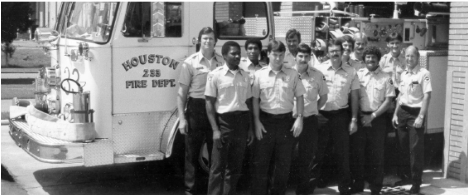
Fire Station 33 C-Shift - 7100 Fannin - 1984.