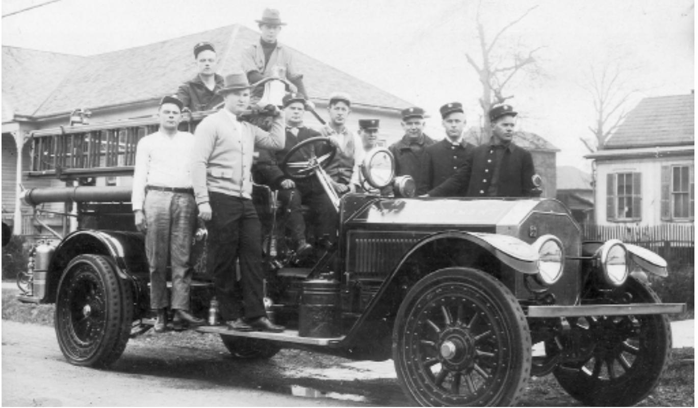
Engine 18 prior to a tragic accident that killed three of these crew members and injured several others.