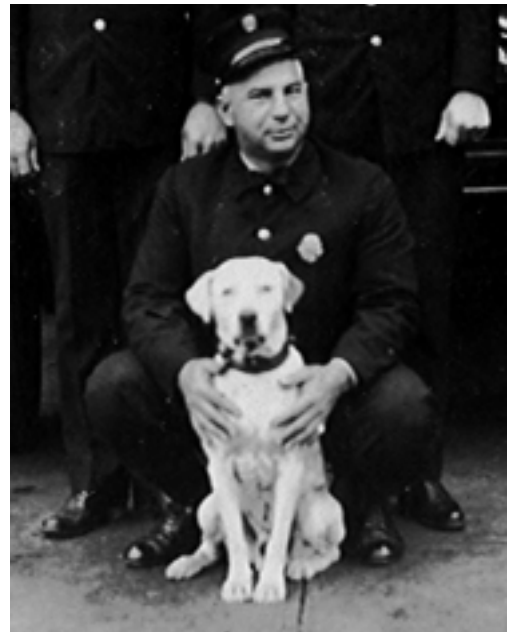
Station 10 -late 1920's Unknown Fire Fighter and Station Mascot