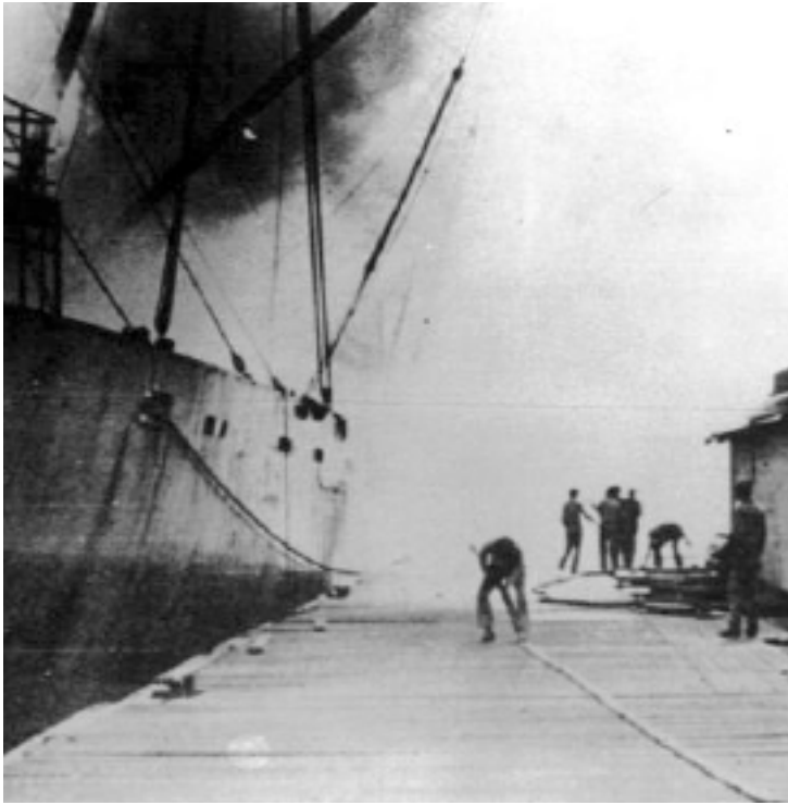
SS Grandcamp shortly before she exploded