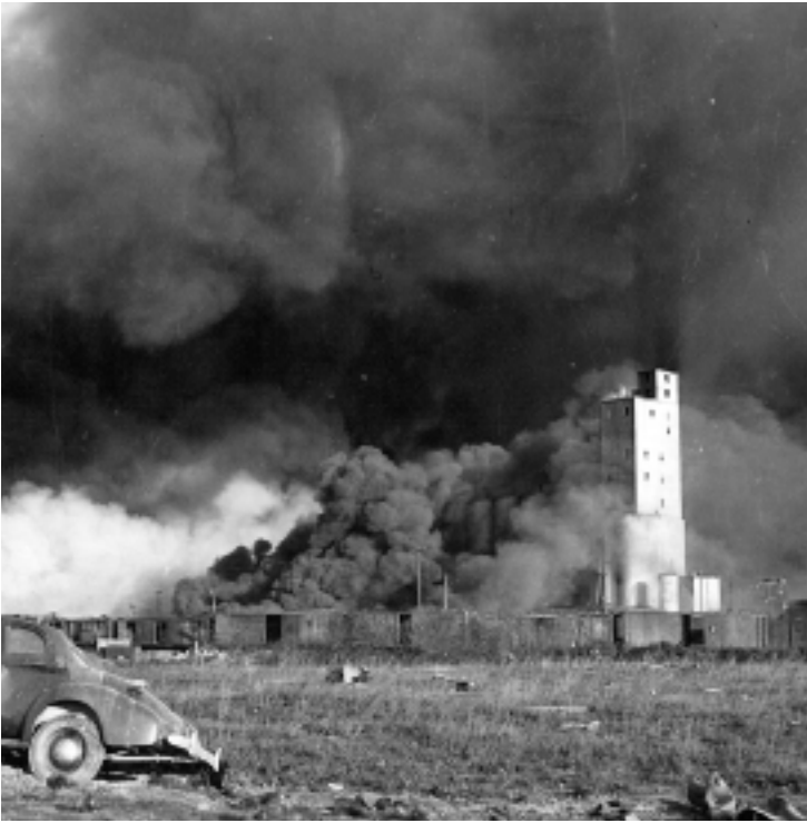
Texas City Disaster - Grain elevator smoke