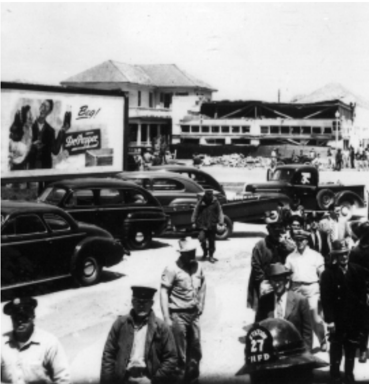
Texas City Disaster - Houston Fire Department