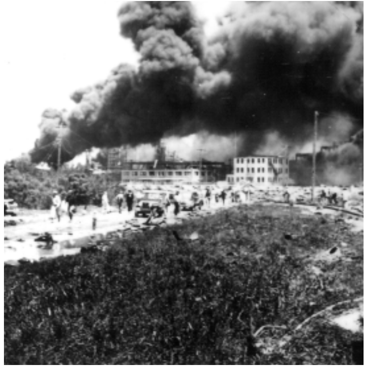
Texas City Disaster - wide view of the smoke and flames