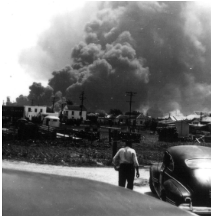
Texas City Disaster - Houston Fire Department