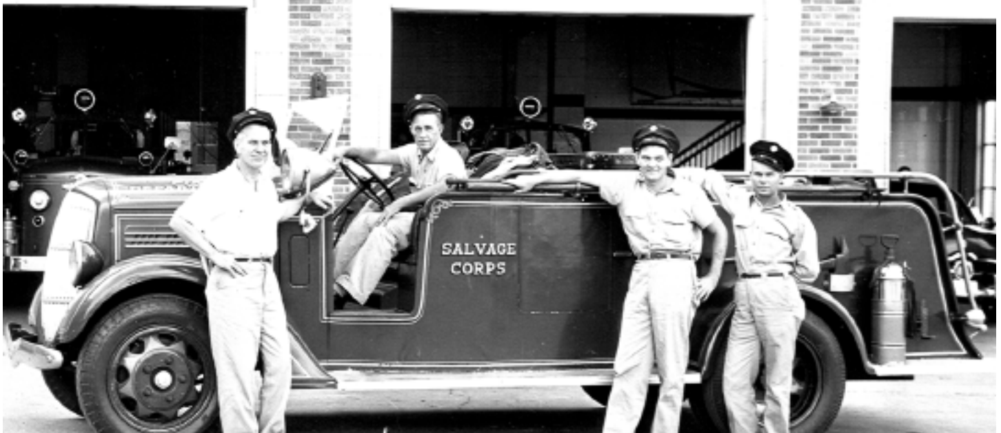
HFD Station 2, 1954 (names of Fire Fighters unknown)