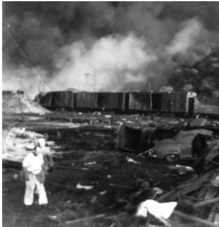
View of 20 Rail Road cars burning