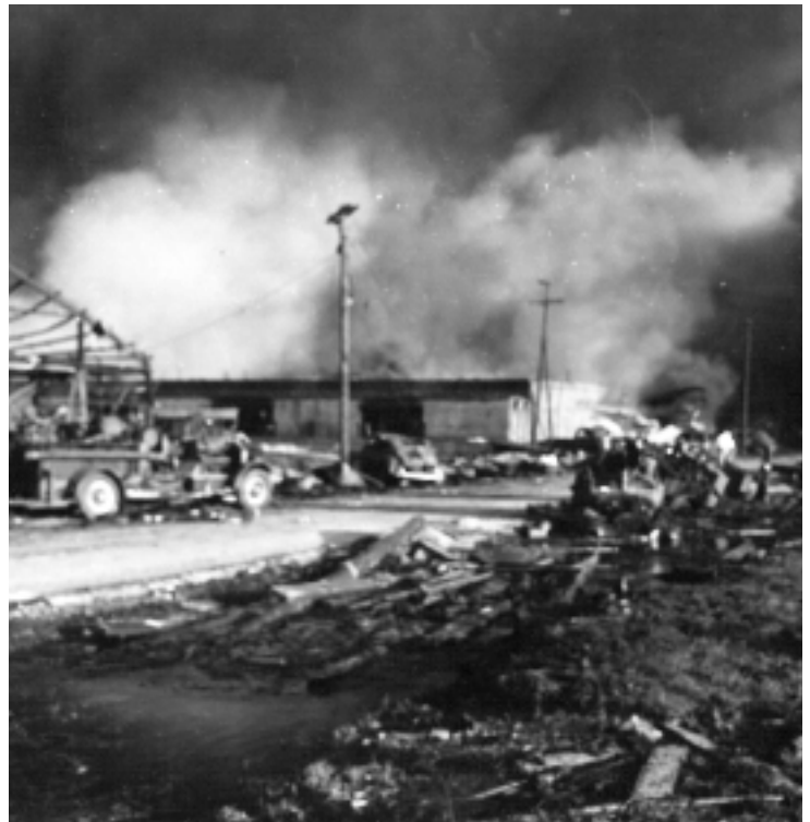
View of the town of Texas City