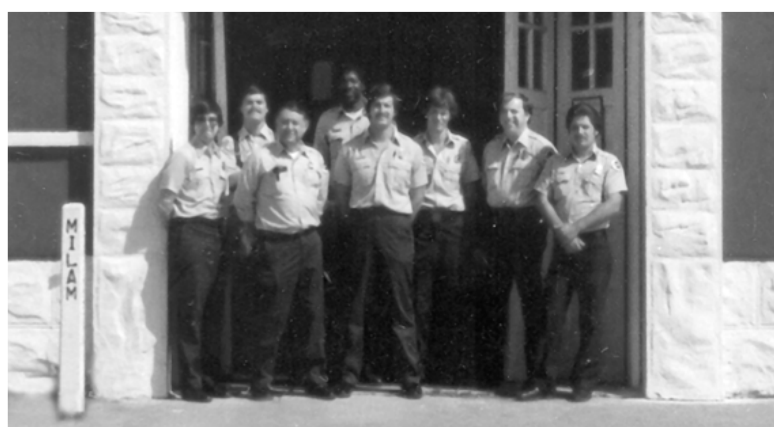
Crew of Station 7 in front of the newly remodeled Old Station 7 - 1981