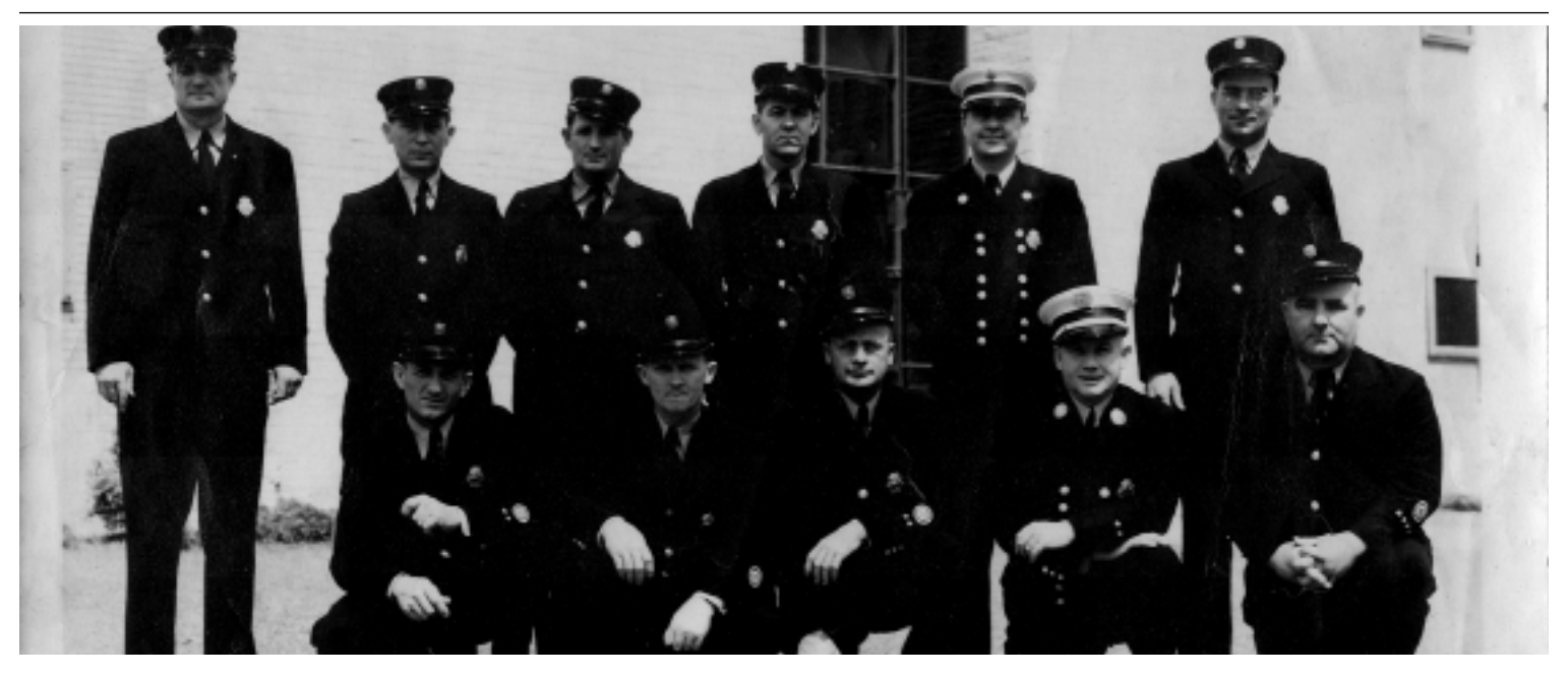
First group of Fire Inspectors - 1945