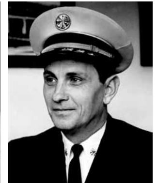
Above from Top Left to Bottom Right: Houston Fire Department Fire Chiefs 1940-1949.