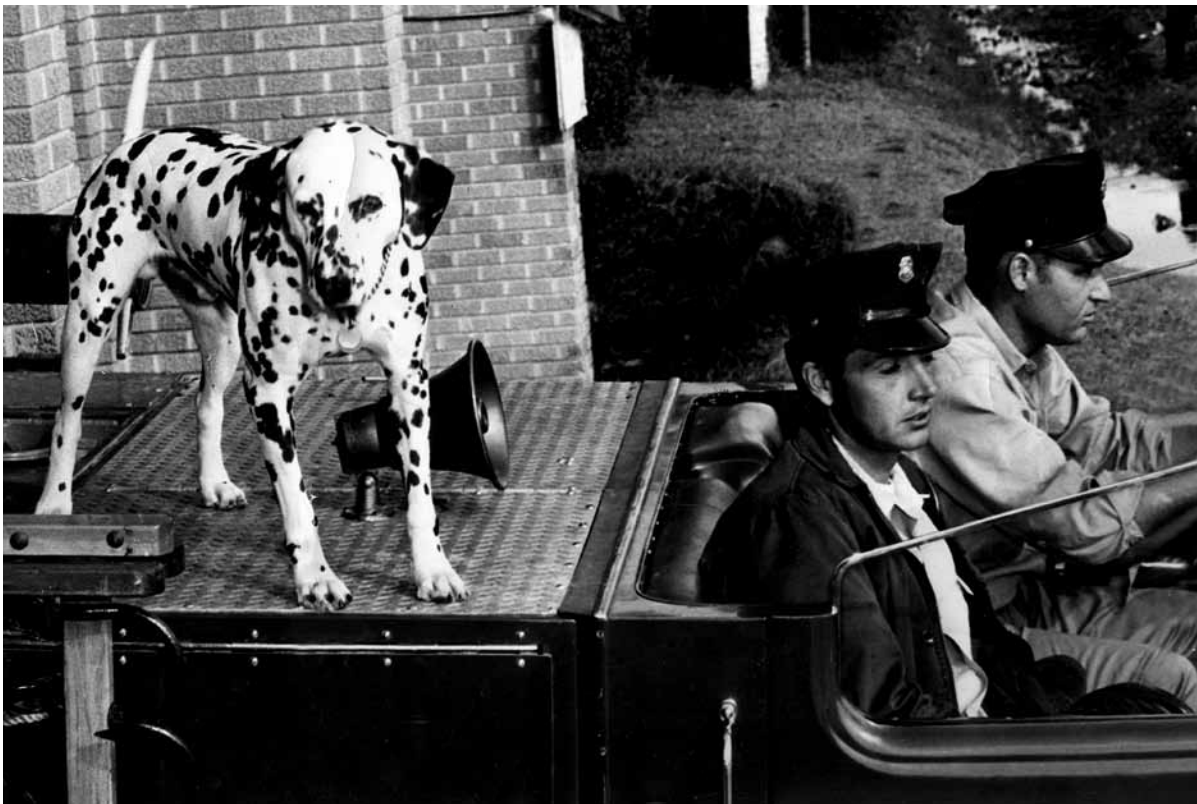
Left: Need Caption. (Caption Credit)