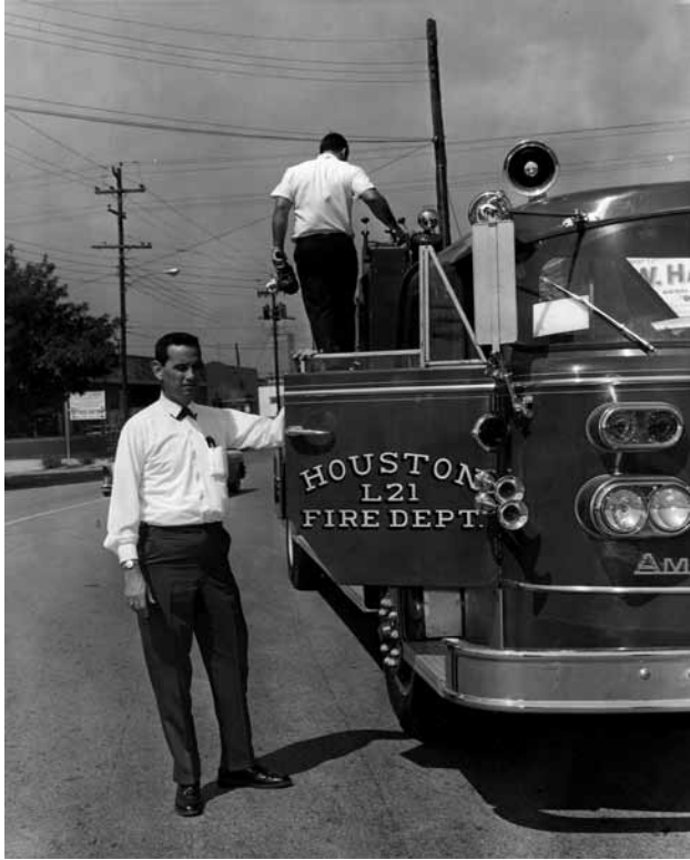
Above Left: Need Caption. (Caption Credit)