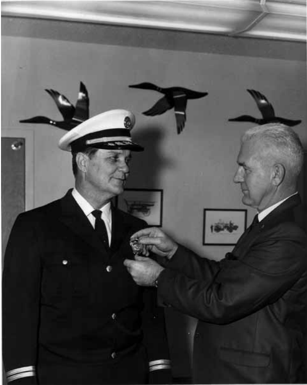
Above: Need Caption. (Caption Credit)