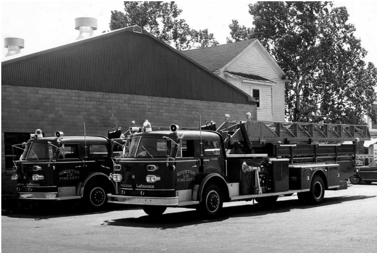
Left: Need Caption. (Caption Credit)