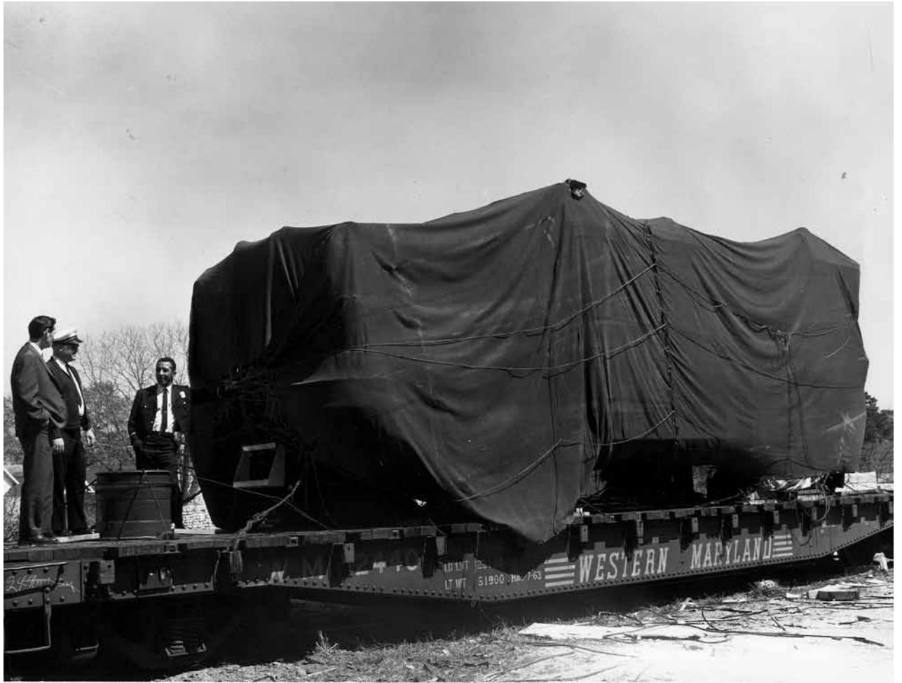
Left: Need Caption. (Caption Credit)