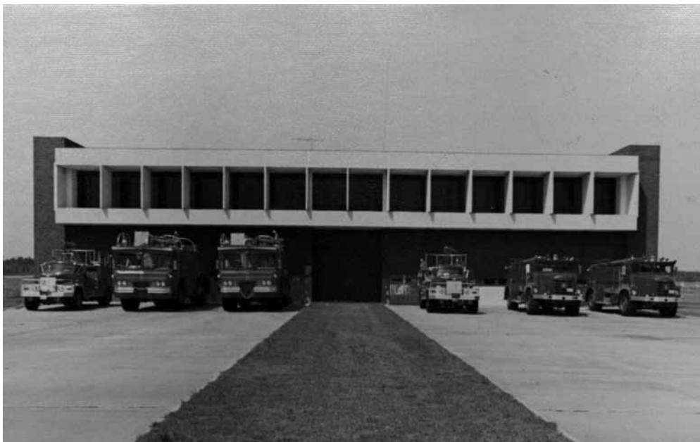
Below Left: Need Caption. (Caption Credit)