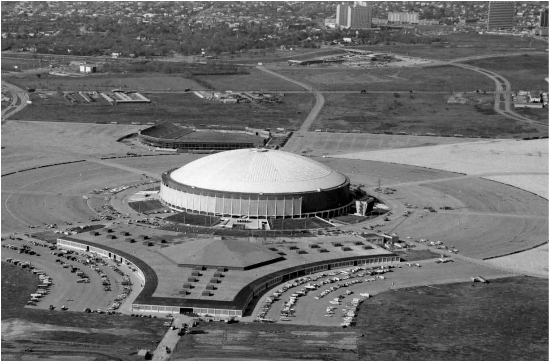
The Astrodome symbolizes the can do spirit of the region. It is located just south of the Medical Center sitting on an old oilfield called Pierce Junction. The temporary “Colt Stadium” can be seen next to it and the Shamrock hotel in the background. 1968.