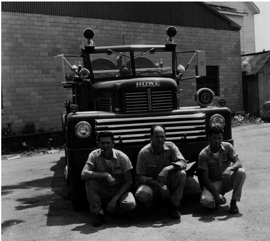
Below Left: Need Caption. (Caption Credit)